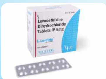
L Lordizin Tab

Draw inspiration from these stories the next time you experience failure. Learn from your mistakes, analyze and accept the failure, but rekindle your passion and keep pursuing your goals.